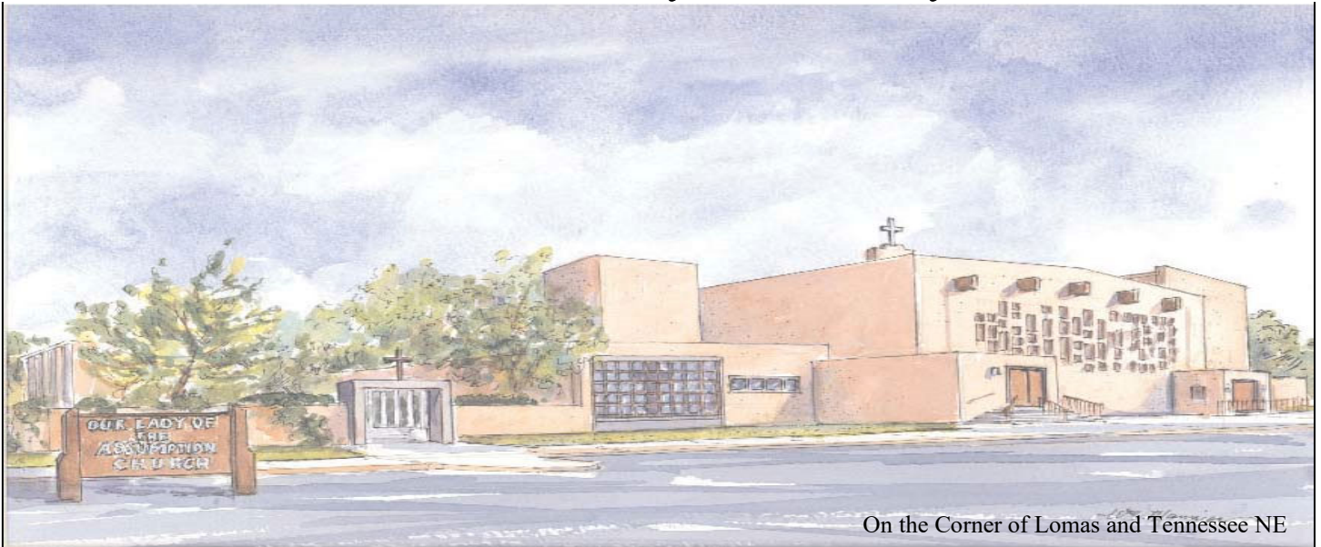
On the Corner of Lomas and Tennessee NE