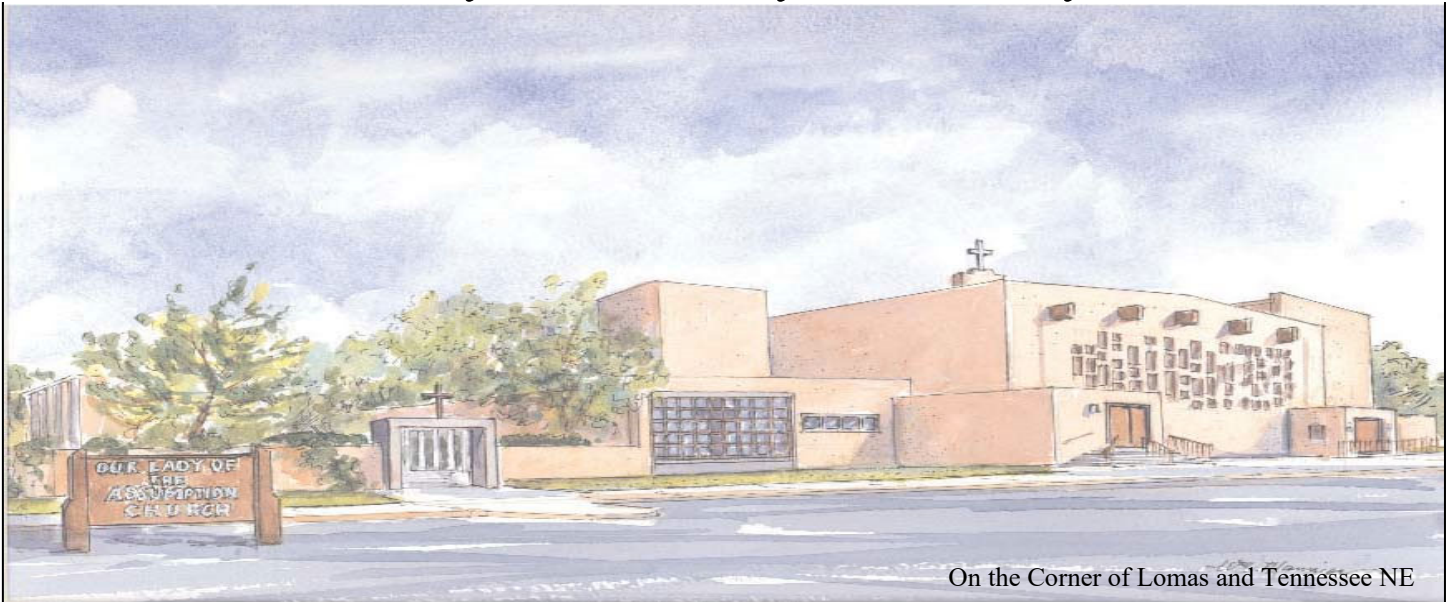
On the Corner of Lomas and Tennessee NE