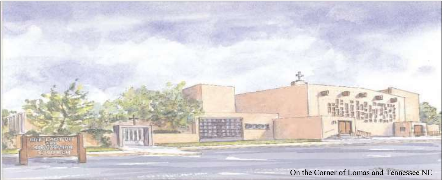
On the Corner of Lomas and Tennessee NE