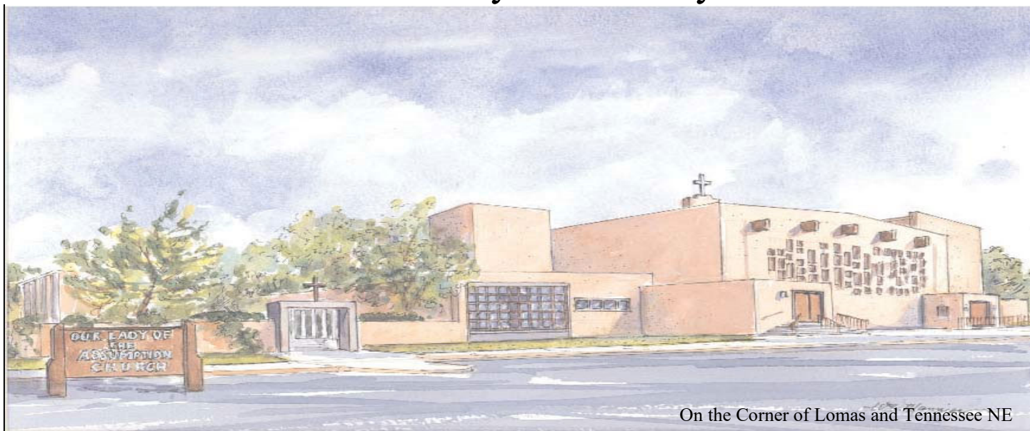
On the Corner of Lomas and Tennessee NE