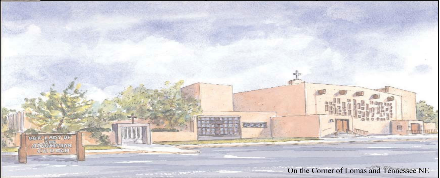
On the Corner of Lomas and Tennessee NE